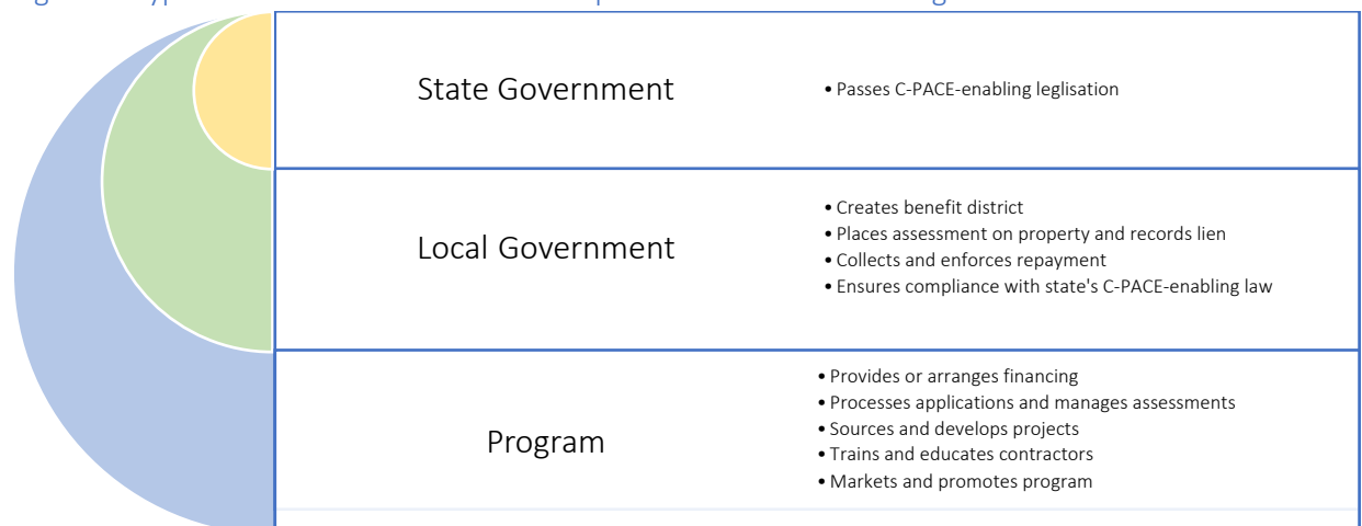
Figure 2: Typical Breakdown of Roles and Responsibilities in C-PACE Programs

Adapted from NASEO, "Accelerating the Commercial PACE Market," April 2016, .